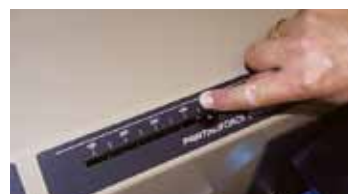
Adjusting printing force