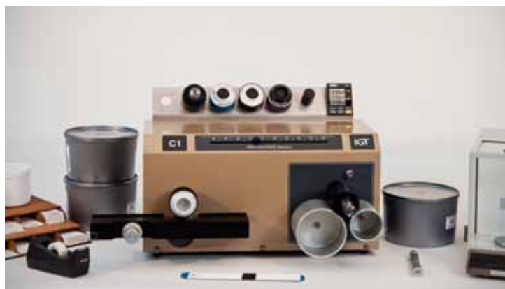
Ready to use