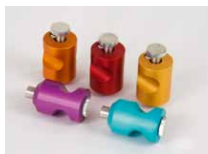
The IGT fixed volume ink pipettes