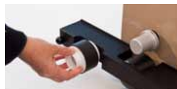
Sliding disc on shaft