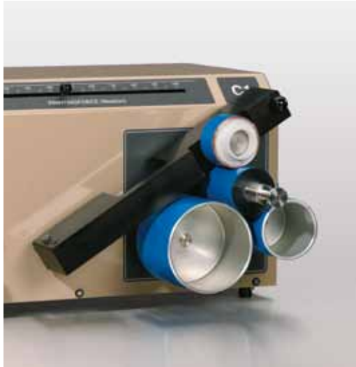
Inking the printing disc