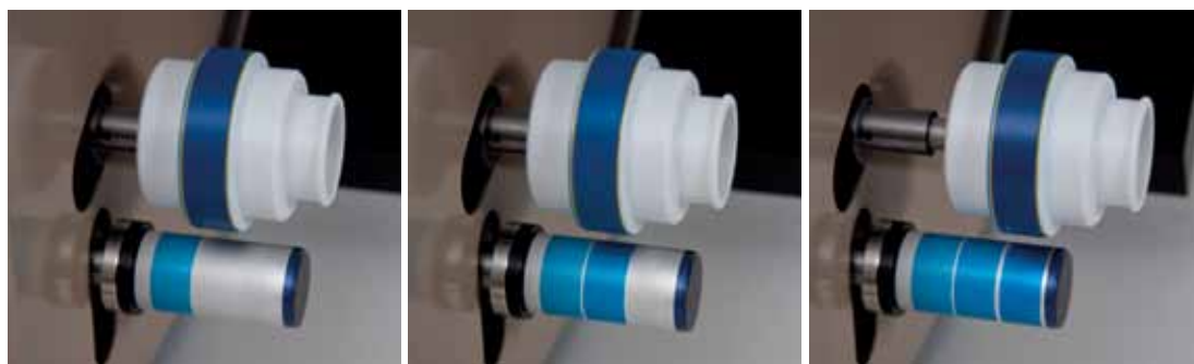
Printing on cans and tubes with CTx3

All C1 testers allow to print on cans with a diameter between 63 and 68 mm. The CTx3 is especially designed to print three strips of 15 mm, besides each other, directly on cans and tubes with a diameter between 16 and 68 mm. This unit is equipped with an easy exchangeable impression cylinder to slide the tin or tube on. Also prints of 35 mm wide can be made on tins and cans. With the CTx3 prints of 35 mm or 3x15 mm and regular prints on flat substrates can be produced as well.