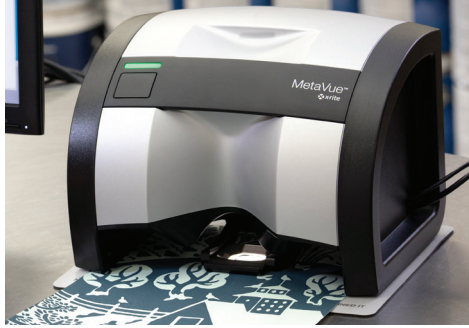
Identify multiple colors in a sample